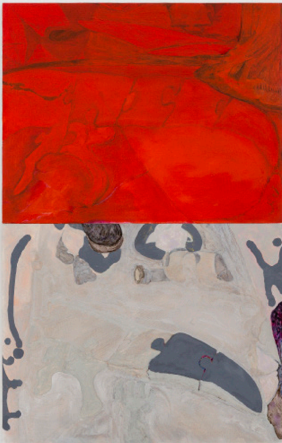
Zora Moniz paw patrol real 1 (play pretend) , 2024 Oil, acrylic, and enamel on panel 22 x 14 in. (55.9 x 35.6 cm) (2 panels) $2,200