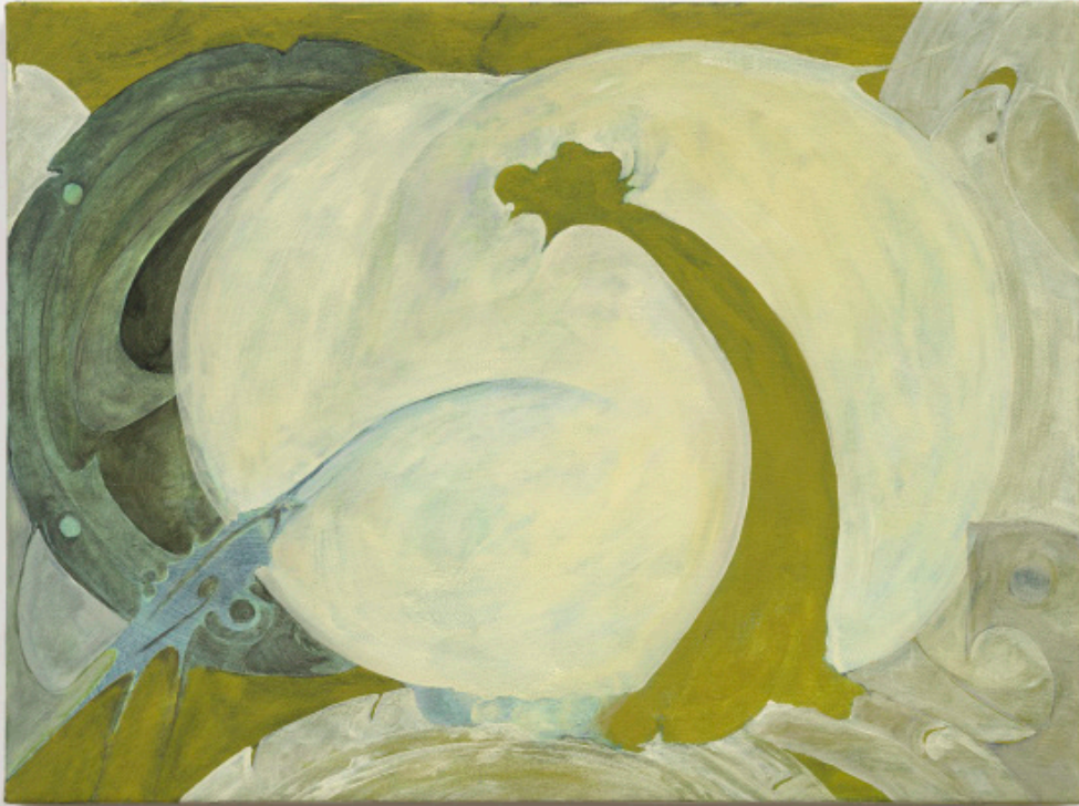
Zora Moniz broccoli (disfiguration, or becoming cartoon) , 2024 oil on linen 12 x 16 in. (30.5 x 40.6 cm) $1,600