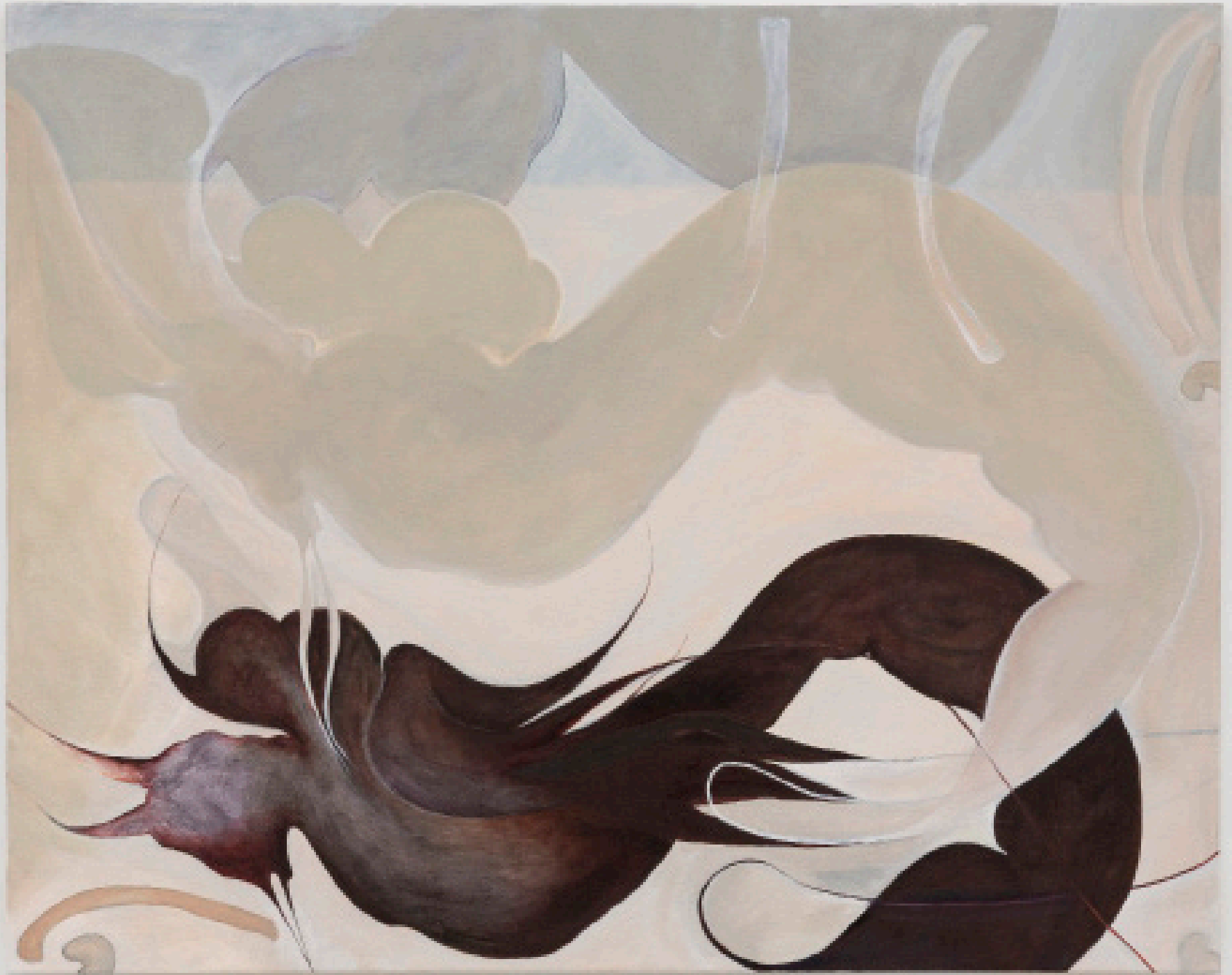
Zora Moniz, spooning (watching someone else play for real) , 2024