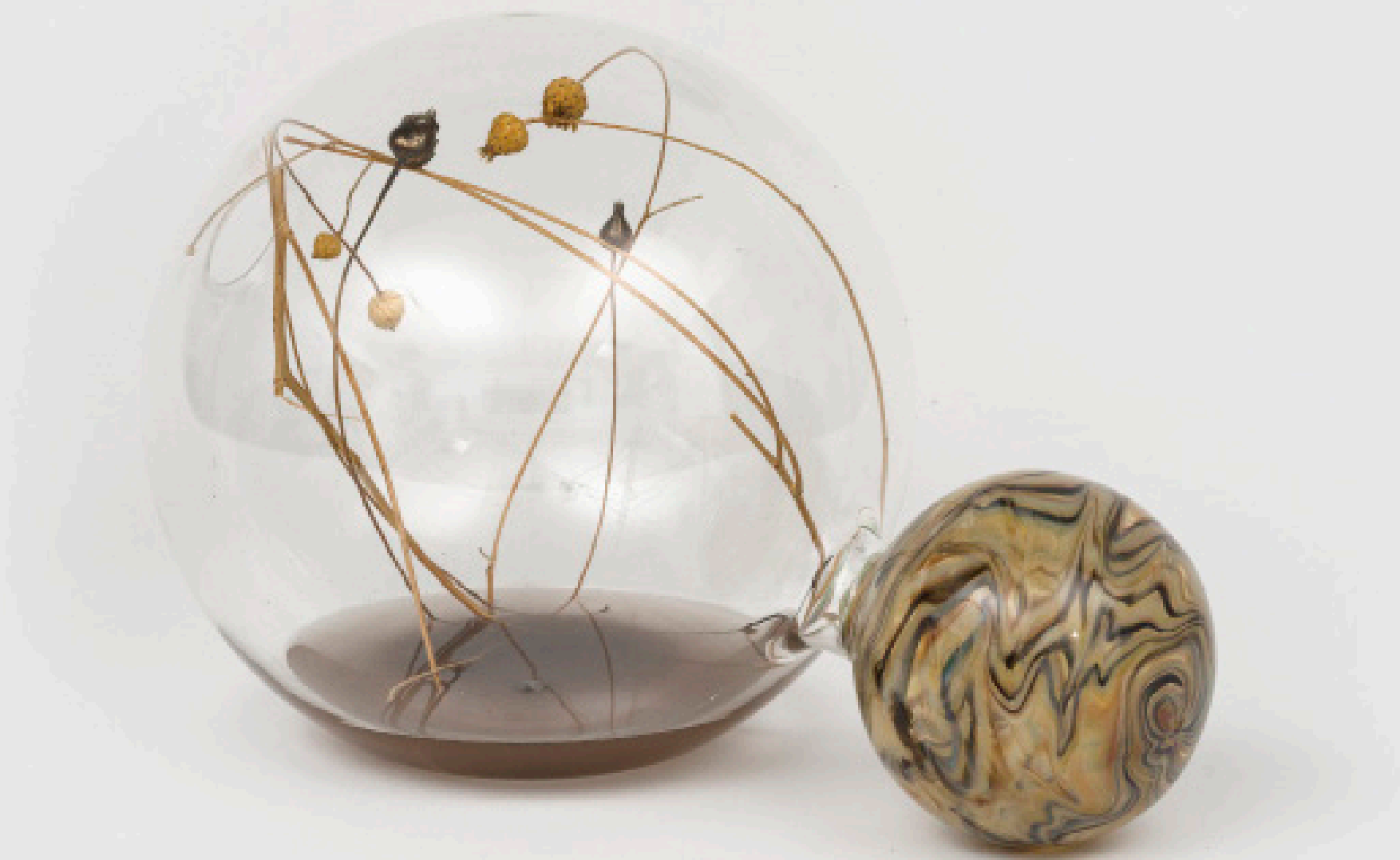
Colleen Billing, Conduit (molecule) , 2024