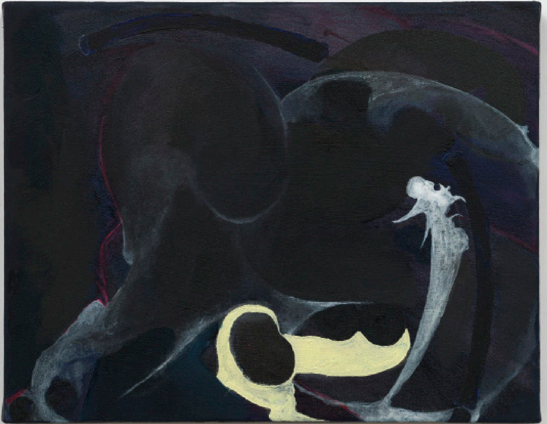
Zora Moniz, speak , 2024