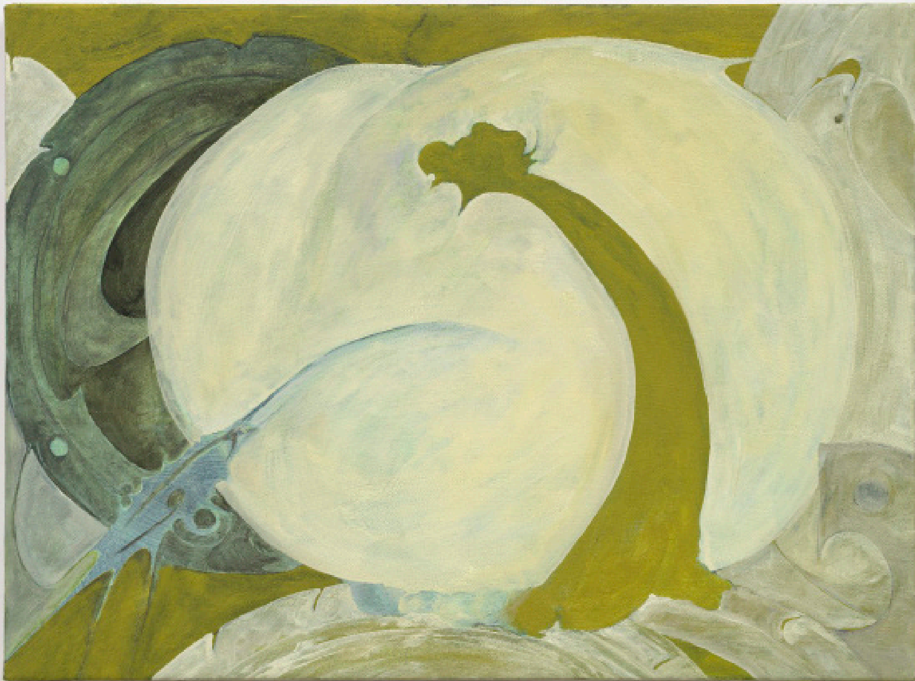
Zora Moniz, broccoli (disfiguration, or becoming cartoon) , 2024