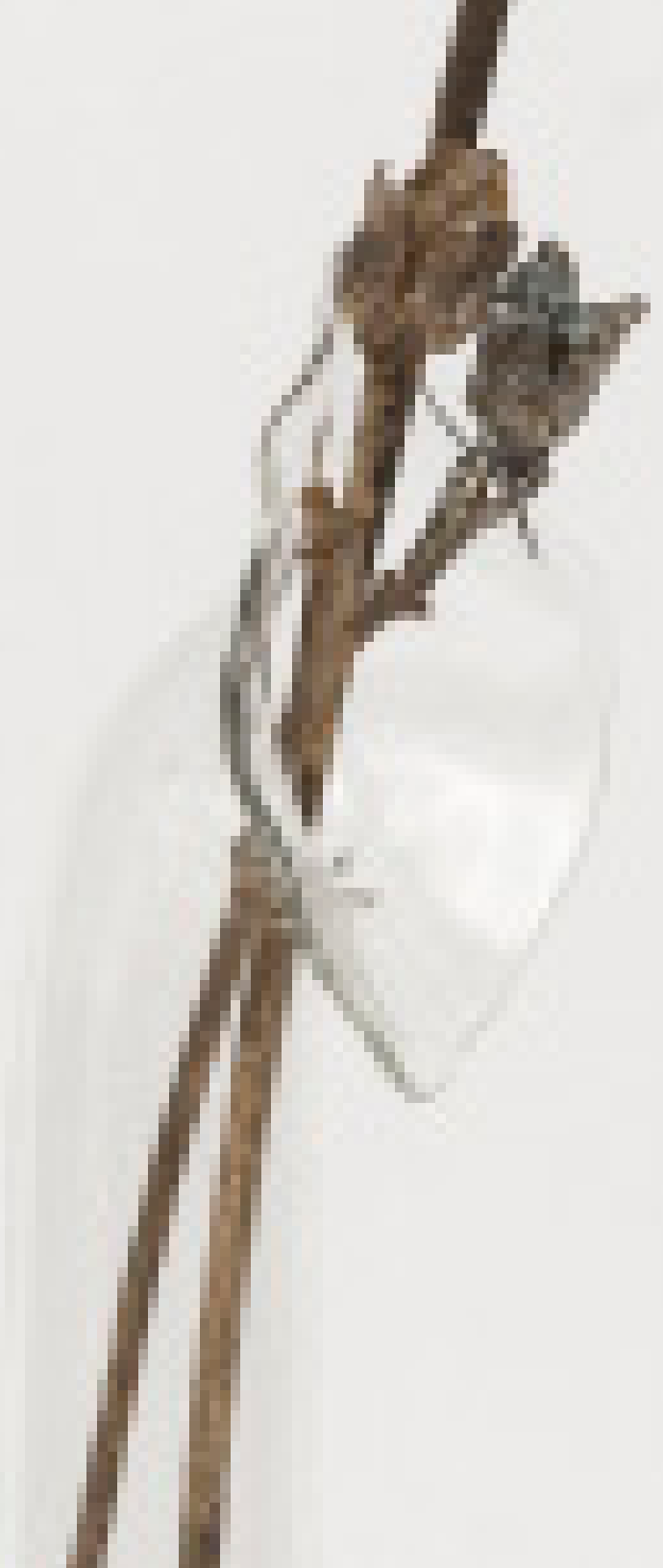
Colleen Billing Conduit (venus current) , 2024 electroplated organic material, silicone, glass klein bottle 11 x 12.5 x 13 in. (27.9 x 31.8 x 33 cm) $1,600