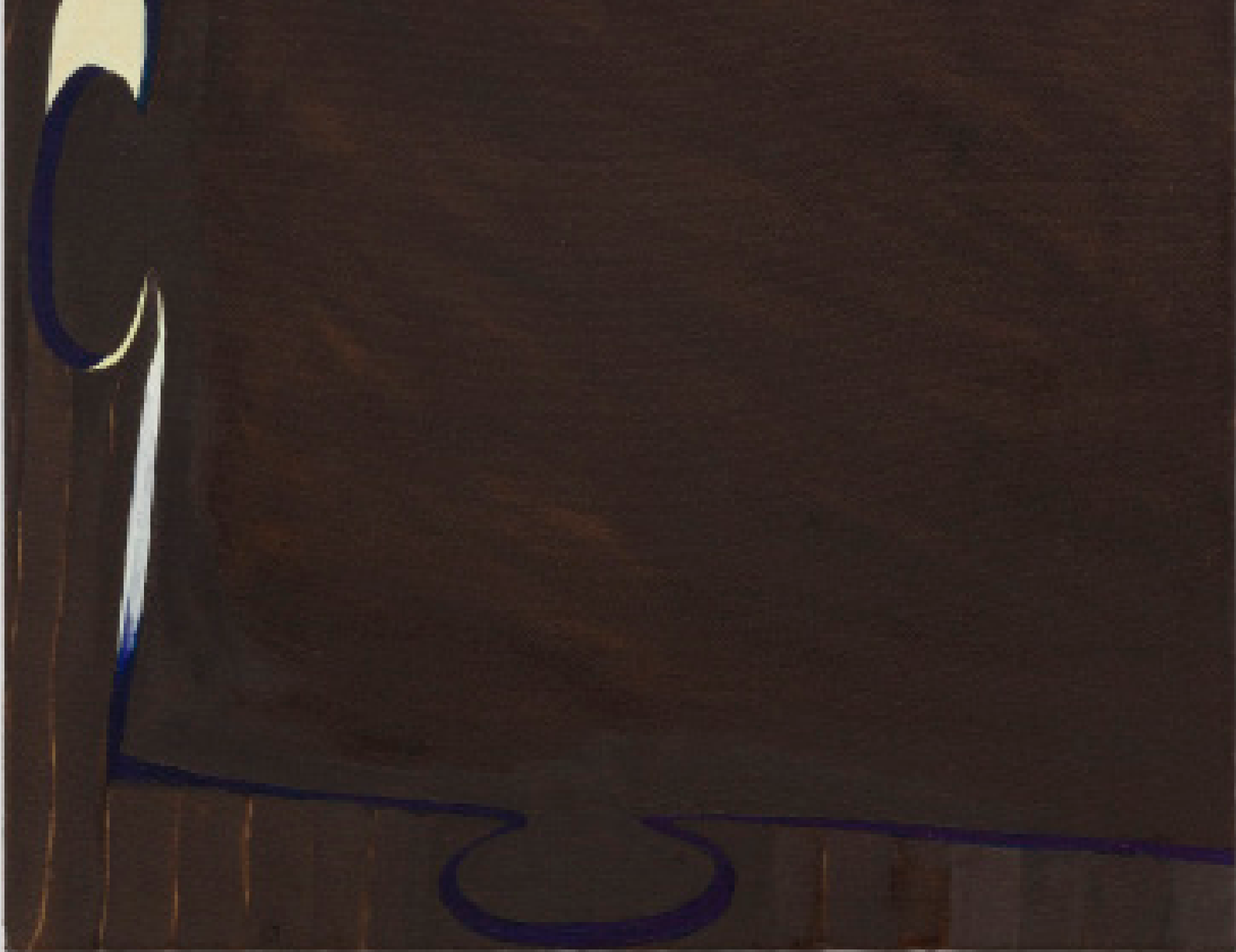
Zora Moniz, pair practice, i swear , 2024