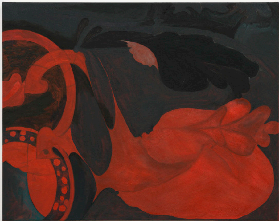
Zora Moniz sanctuary of song lovers , 2024 oil on canvas 24 x 19 in. (60.9 x 48.3 cm) $2,400