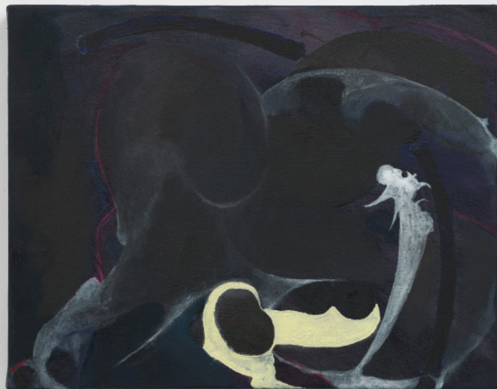
Zora Moniz speak , 2024 oil and acrylic on linen 11 x 14 in. (28 x 35.6 cm) $1,600