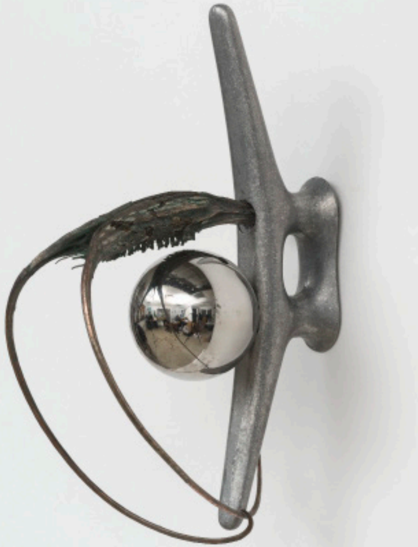
Colleen Billing, Y , 2023