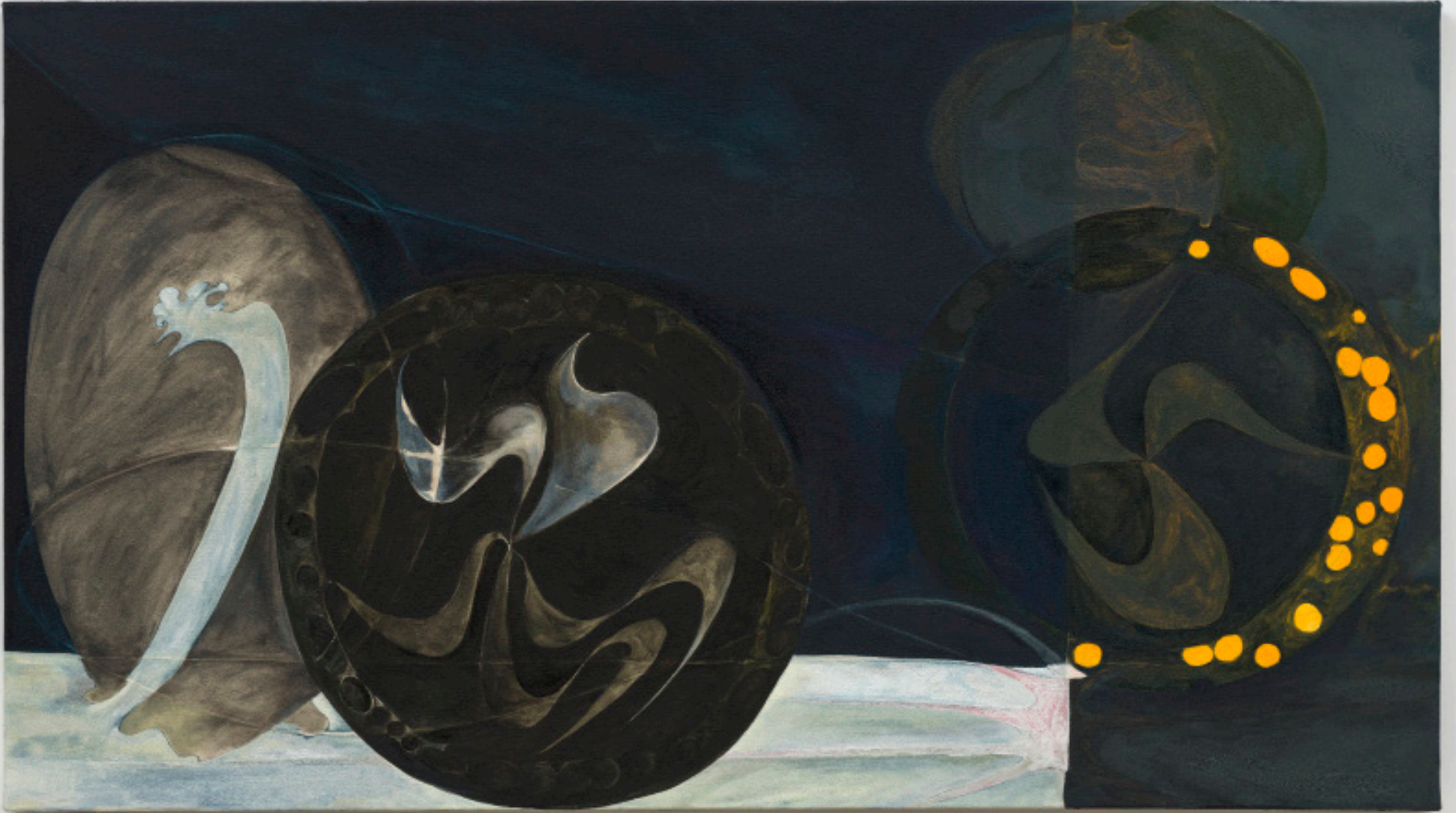
Zora Moniz, i heard the sound of blood whooshing through veins and it was like a song , 2024