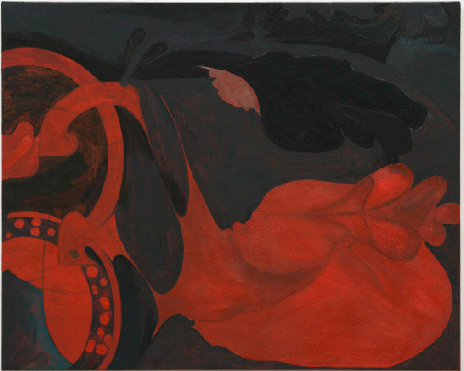
Zora Moniz, sanctuary of song lovers , 2024