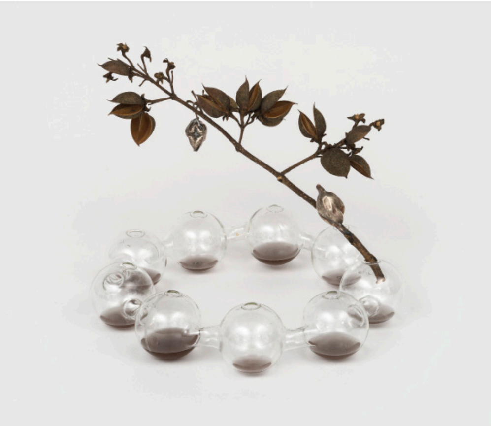
Colleen Billing Conduit (closed loop) , 2024 electroplated organic material, silicone, glass klein bottle 11 x 12.5 x 13 in. (27.9 x 31.8 x 33 cm) $1,600