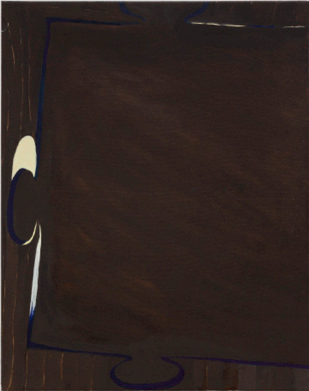
Zora Moniz pair practice, i swear , 2024 oil on canvas 24 x 19 in. (60.9 x 48.3 cm) $2,400