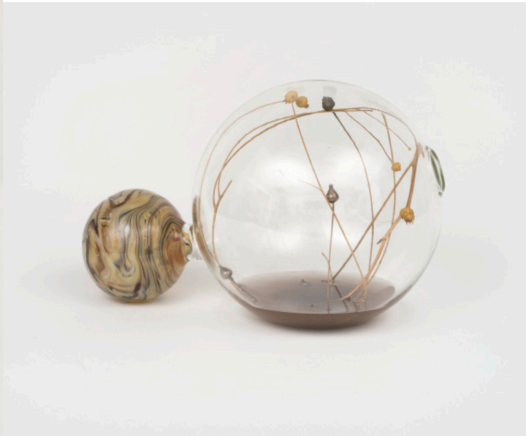
Colleen Billing Conduit (molecule) , 2024 electroplated organic material, Centaurea cyanus , silicone, glass 10 x 15 x 10 in. (25.4 x 38.1 x 25.4 cm) $1,600