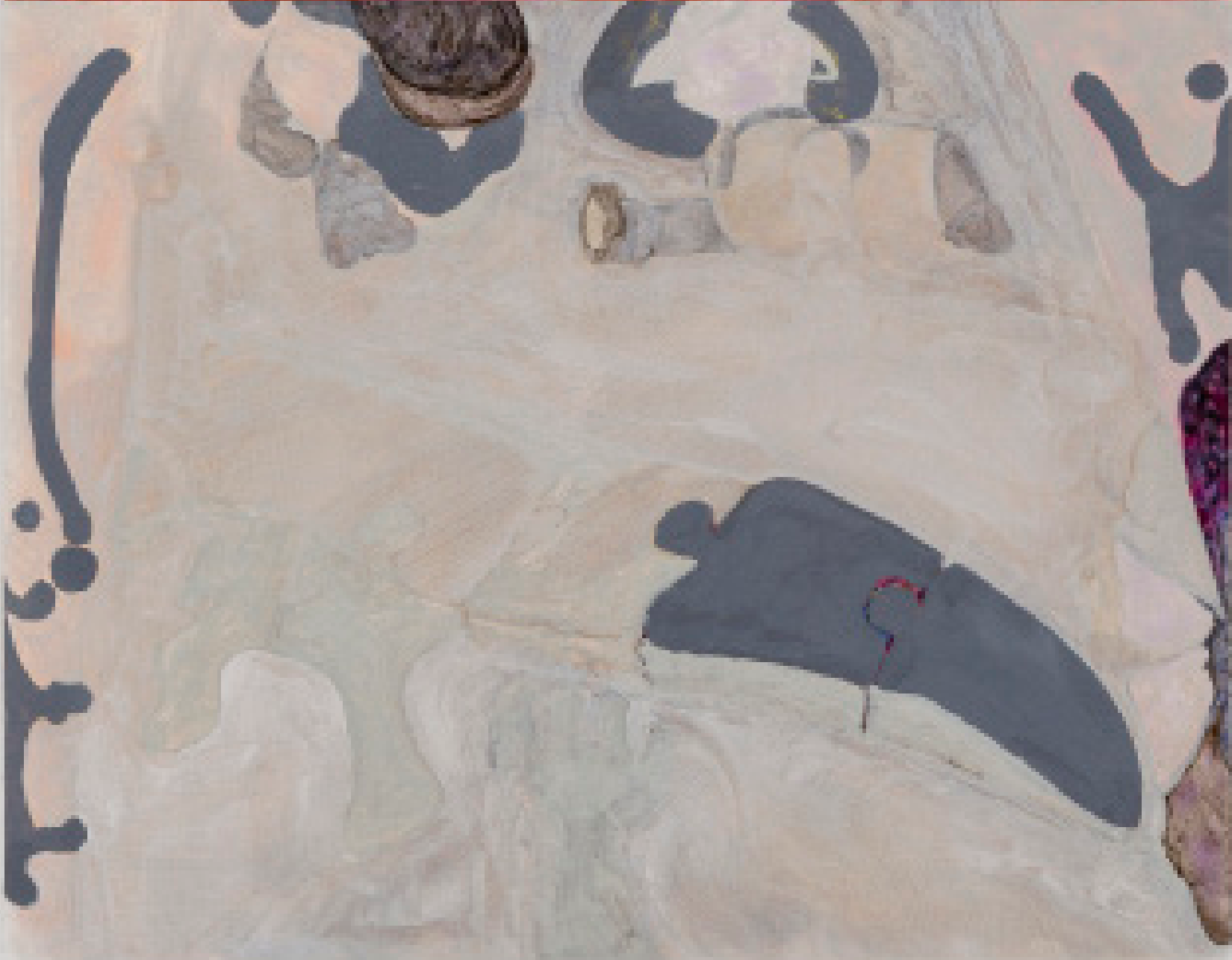
Zora Moniz, paw patrol real 1 (play pretend) , 2024