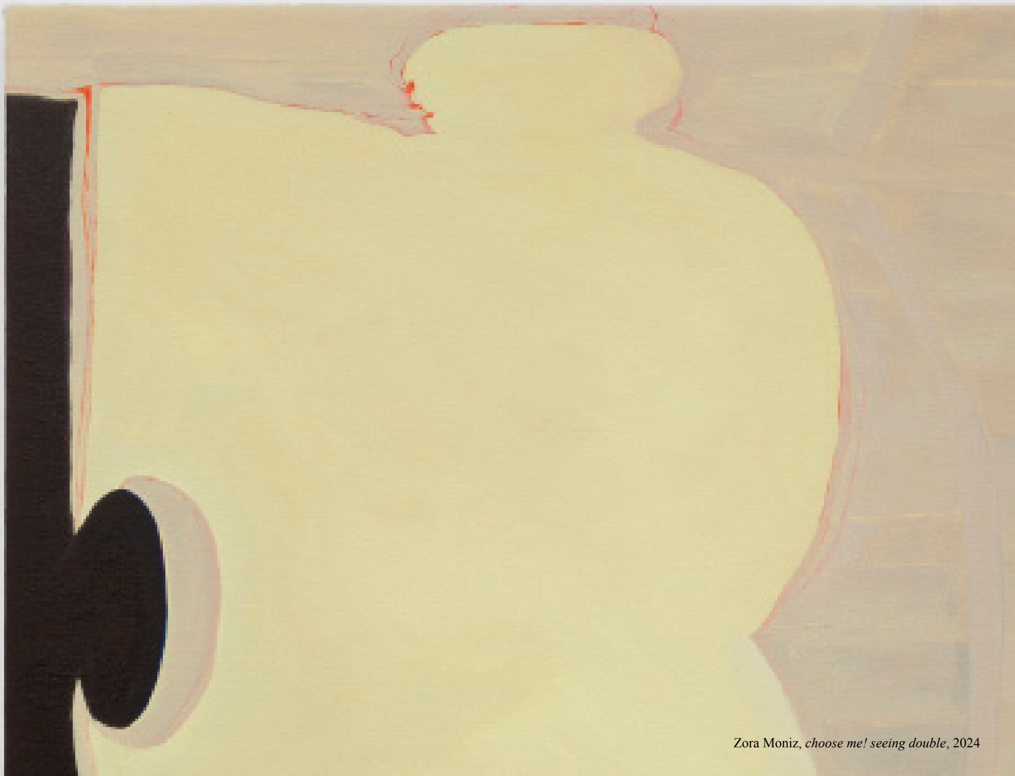
Zora Moniz, choose me! seeing double , 2024