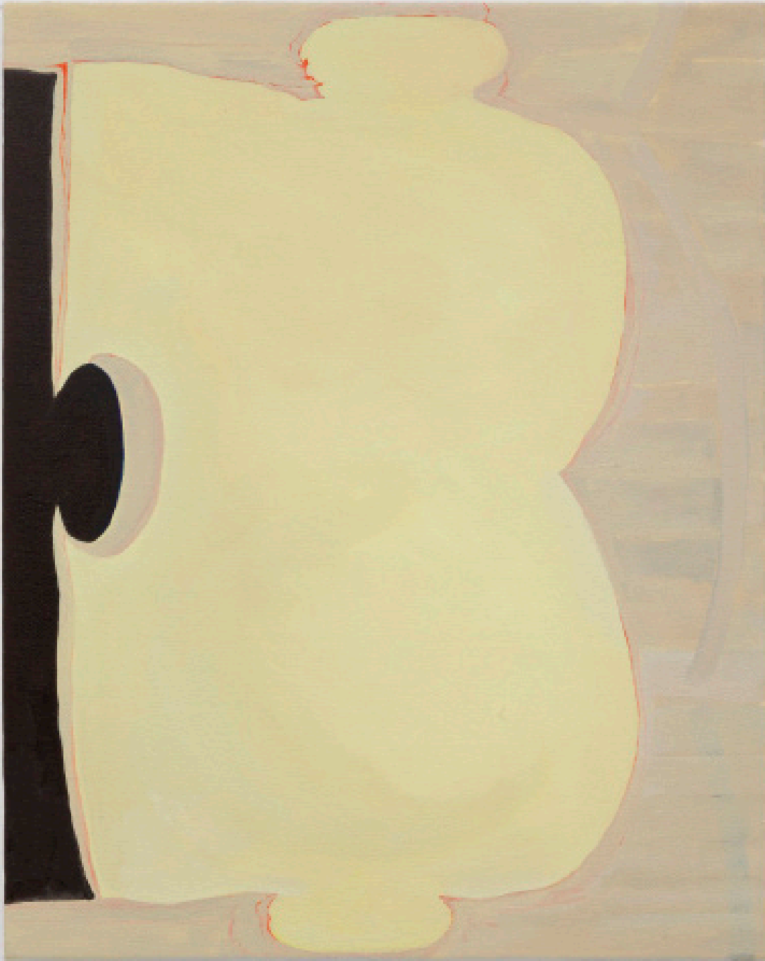
Zora Moniz choose me! seeing double , 2024 oil on canvas 24 x 19 in. (60.9 x 48.3 cm) $2,400