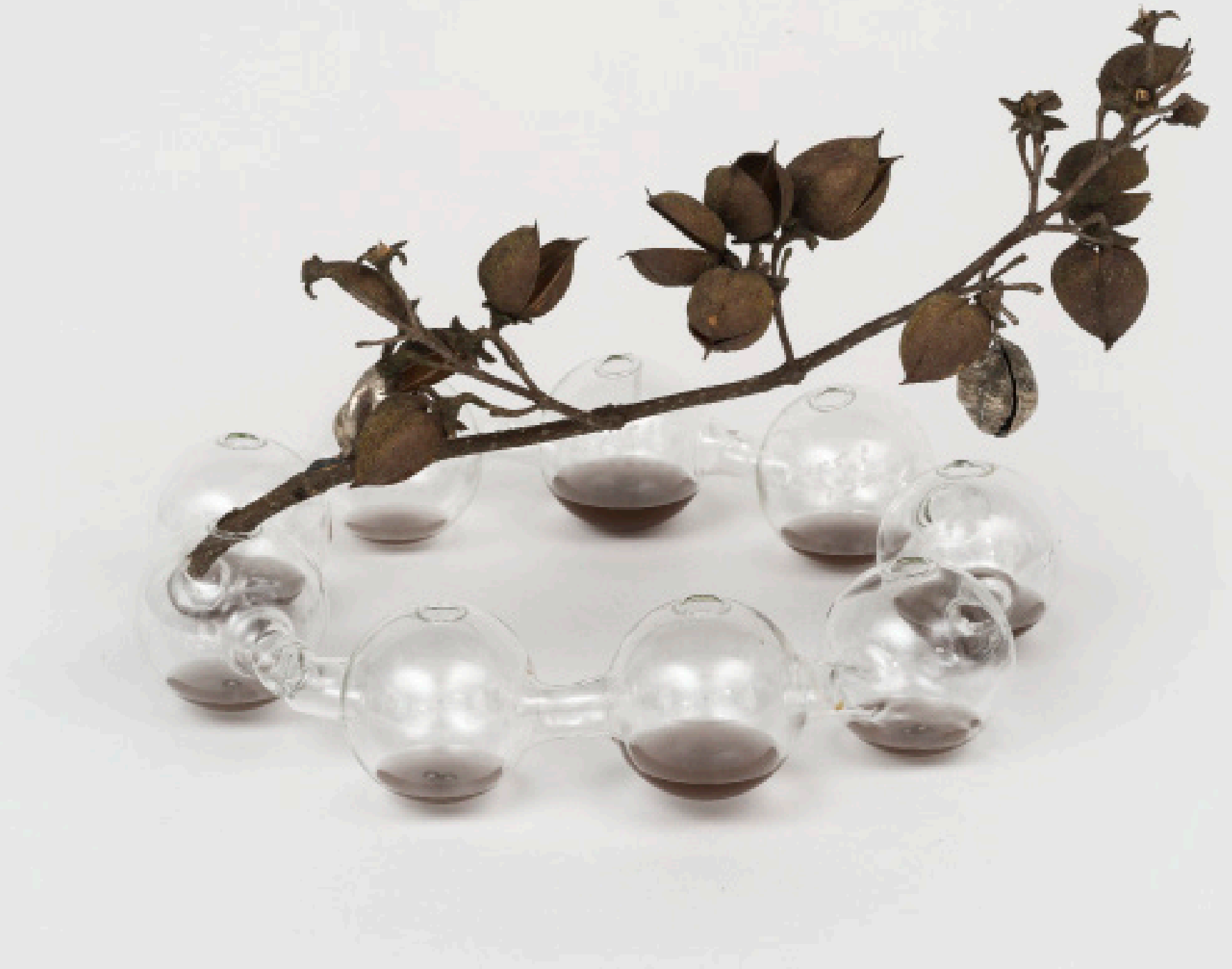
Colleen Billing, Conduit (closed loop) , 2024