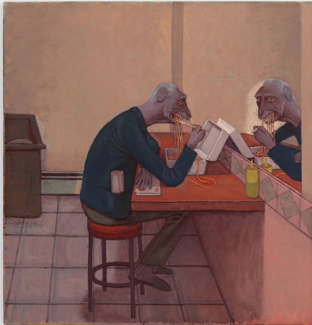
Clayton Schiff The Diner 2024 48”h x 46”w (122 x 117cm) Oil on canvas CS055